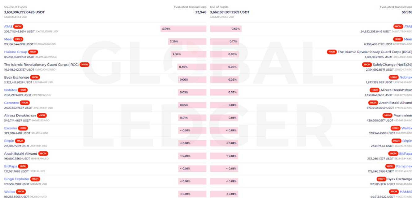
Img. 3 Grinex high-risk counterparty exposure before sanctions. Mar 6–Aug 14 2025

Before sanctions, high-risk exposure was a notable part of Grinex’s activity